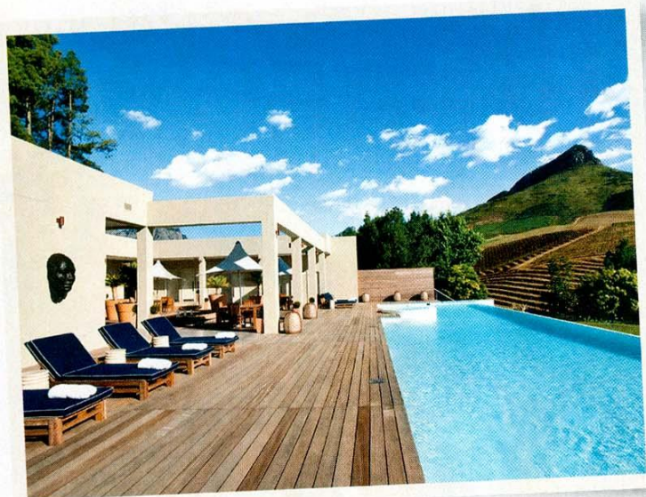
The Delaire Graff Lodges & Spa, in Stellenbosch, one of two It List hotels in South Africa this year.

For T+L's sixth annual It List, we traversed the globe, putting the latest crop of hotels to the test. Here, our 50 favorite new properties, from a pioneering farmstead in South Africa to a sexy Manhattan skyscraper. Read on for this year's groundbreaking openings.